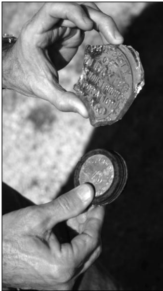
Fragments of IV bottles and other medical waste are scattered about the old hospital site.