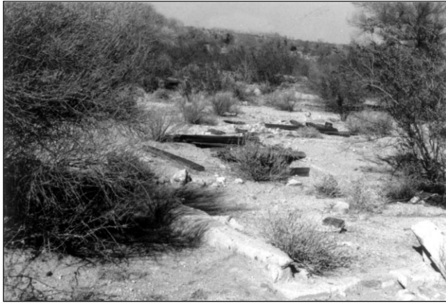
Scattered ruins of Contractors General Hospital as it appears today.

Building that tunnel had been one of the major achievements in the creation of the entire aqueduct. It had taken the efforts of hundreds of men and several years to complete. A work camp, almost a company town, with dormitories, dining hall, offices and workshops, had grown up at the eastern end of the tunnel. Because of round-the-clock shifts, the town was active day and night.